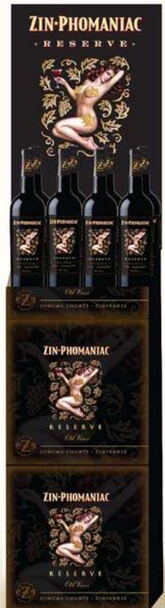
Case Stack with case card (AMS #100207R)